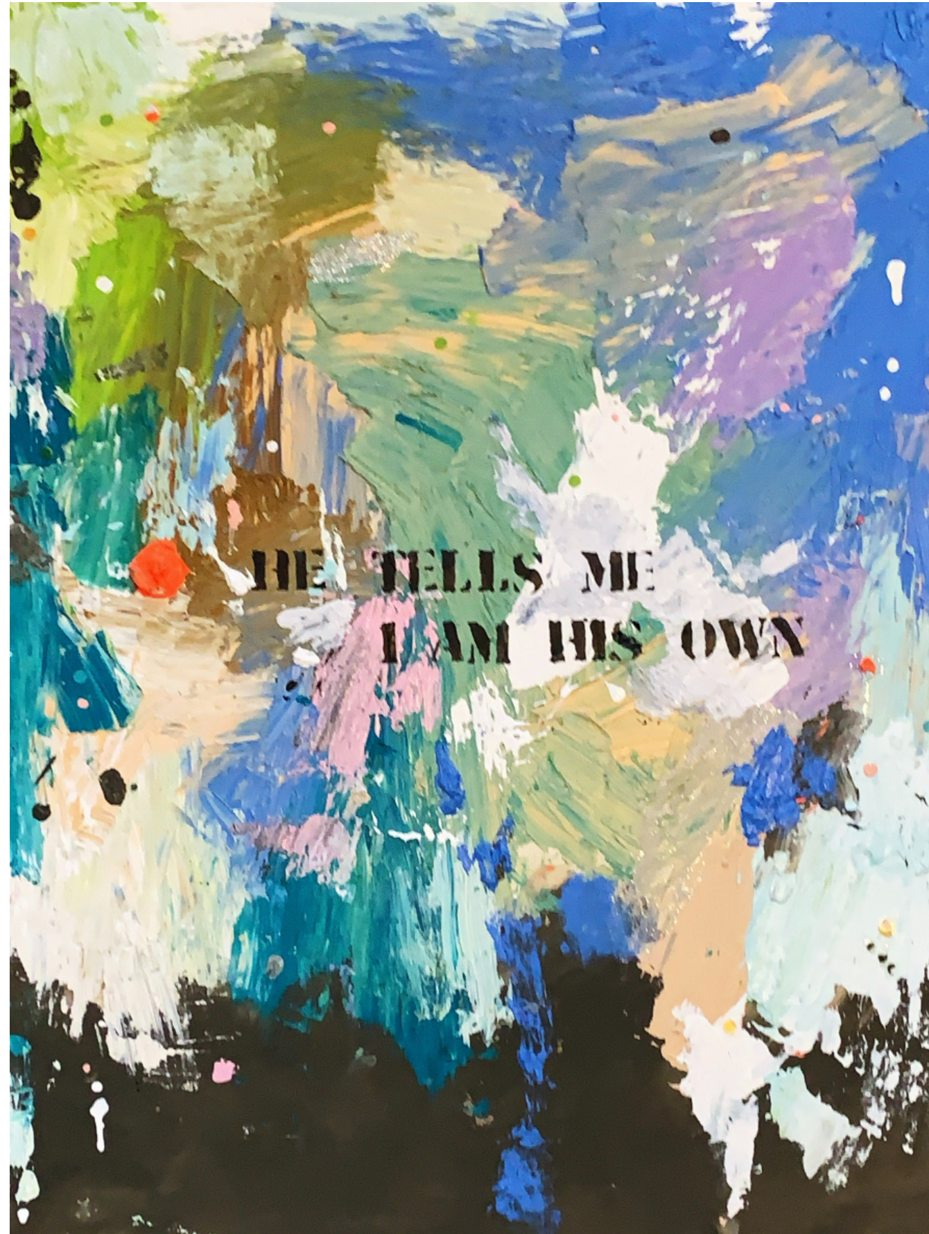
<He tells me>, 60x80cm, mixed media on wood, 2022