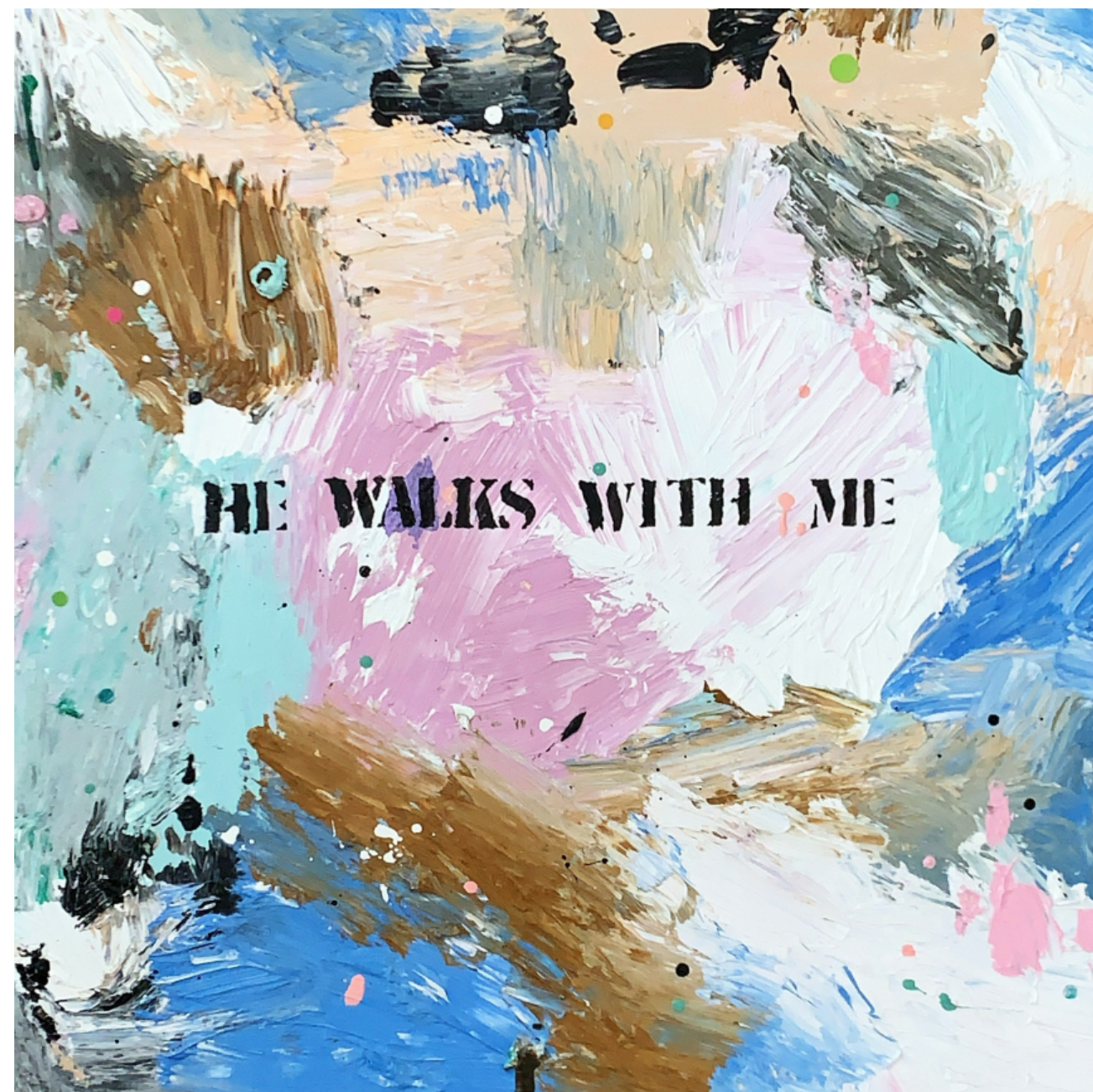
<He talks with me>, <He walks with me>, 60x60cm, mixed media on wood, 2022