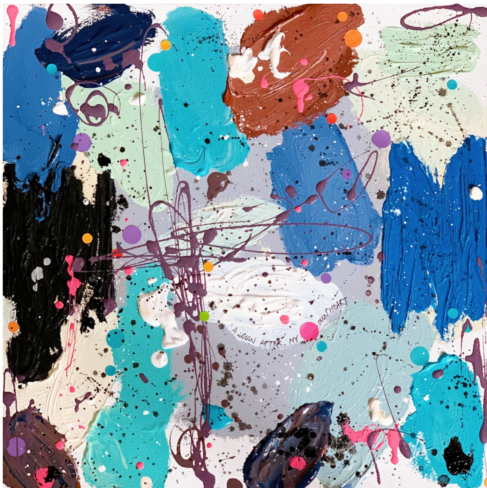
<Rework_a man after my own heart> mixed media on paper, canvas, 40x40cm, 2021