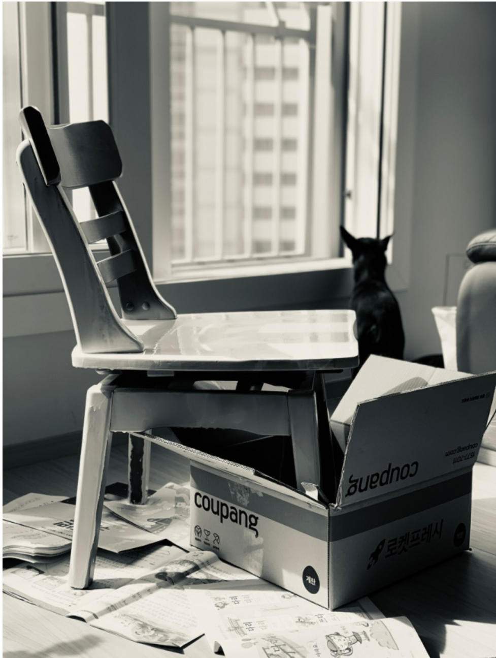
untitled_시드, Digital c-print, 29x21cm, 2020 untitled_커피 한잔, Digital c-print, 29x21cm, 2020 untitled_과정, Digital c-print, 29x21cm, 2023