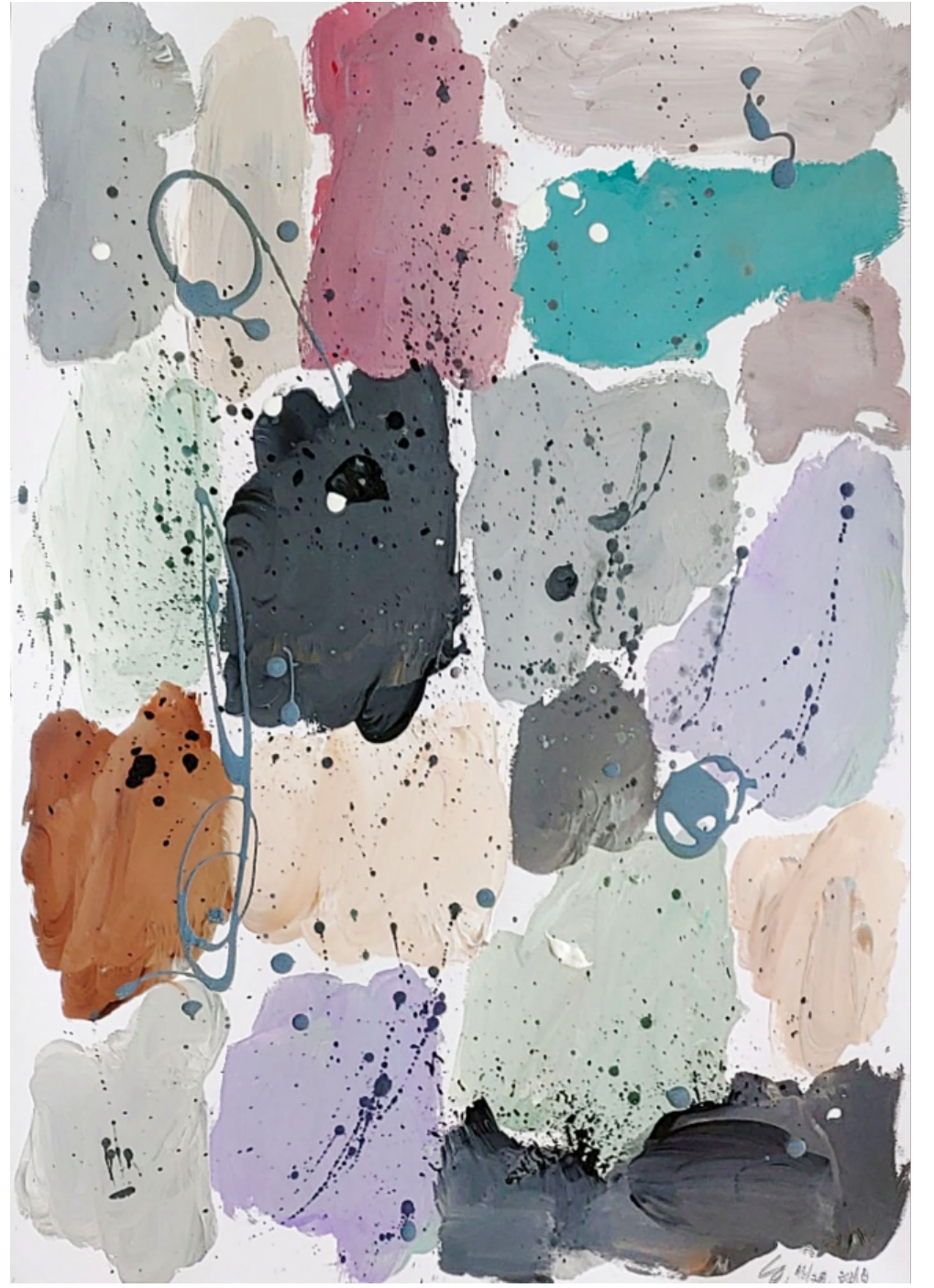
<Pallete_S #5, #11, #12>, mixed media on paper, 29,7x42cm, 2020