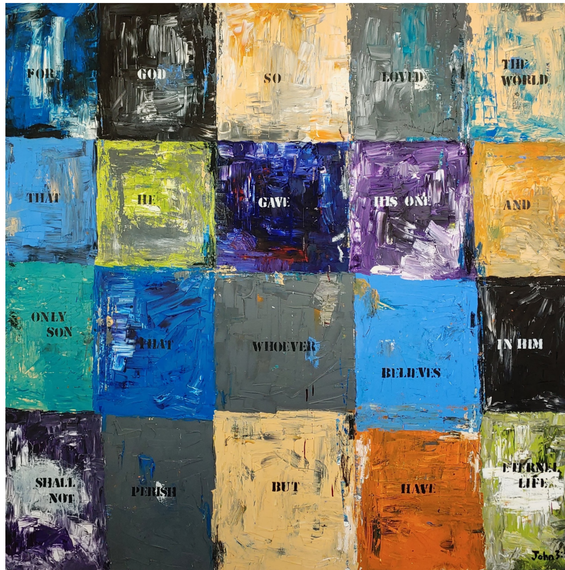
<John 3,16>, Oil on Canvas, 160x160cm, 2019

I hope the power of these words that the world thinks are boring can be conveyed well. There are words in here, so the words must have the power to move.