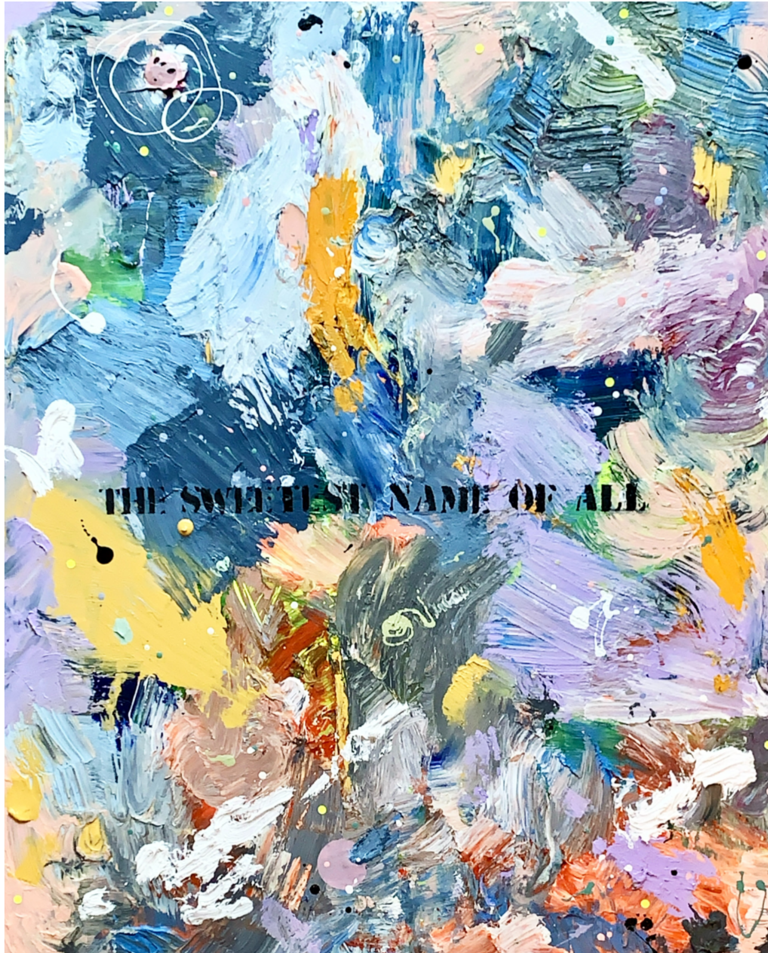
<the sweetest name of all> 70x100cm, mixed media on wood, 2022