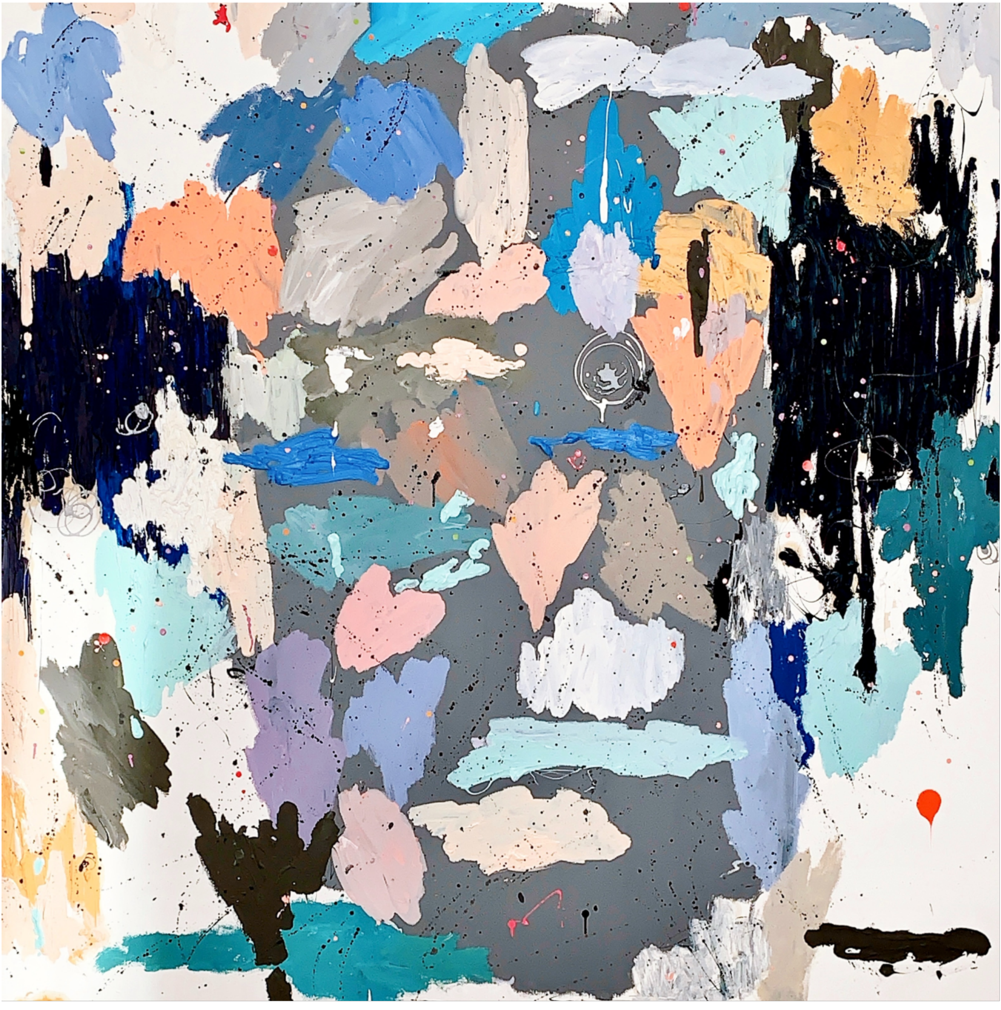
<Rework_2> mixed media on canvas, 150x150cm, 2021