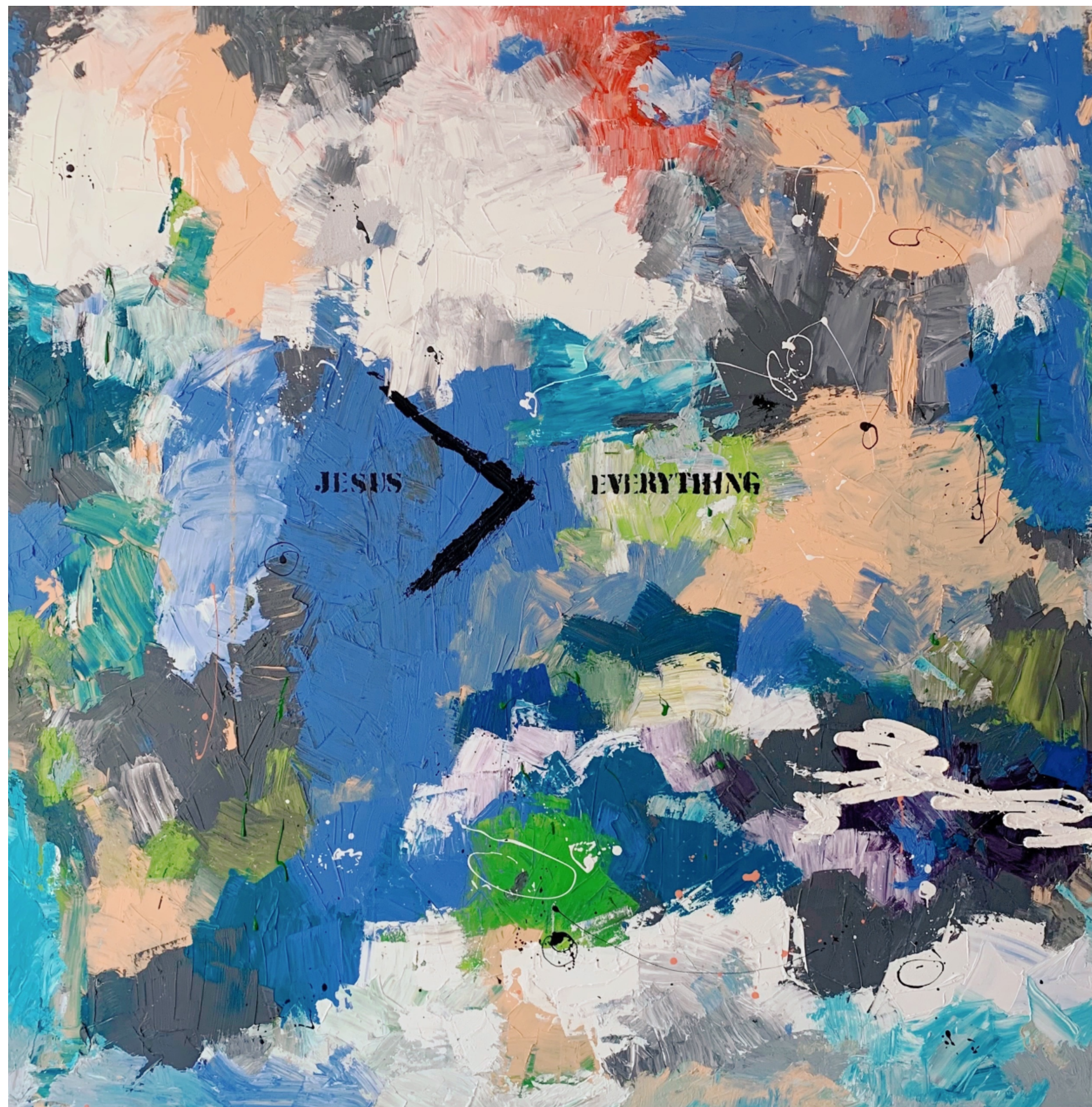
<Jesus>Everything>, mixed media on canvas, 160x160cm, 2020

All the inspiration for my work comes from Him. The truth that the world knew or didn't know remains unchanged. How nice it would be to find Him through the words and sentences written in the picture!