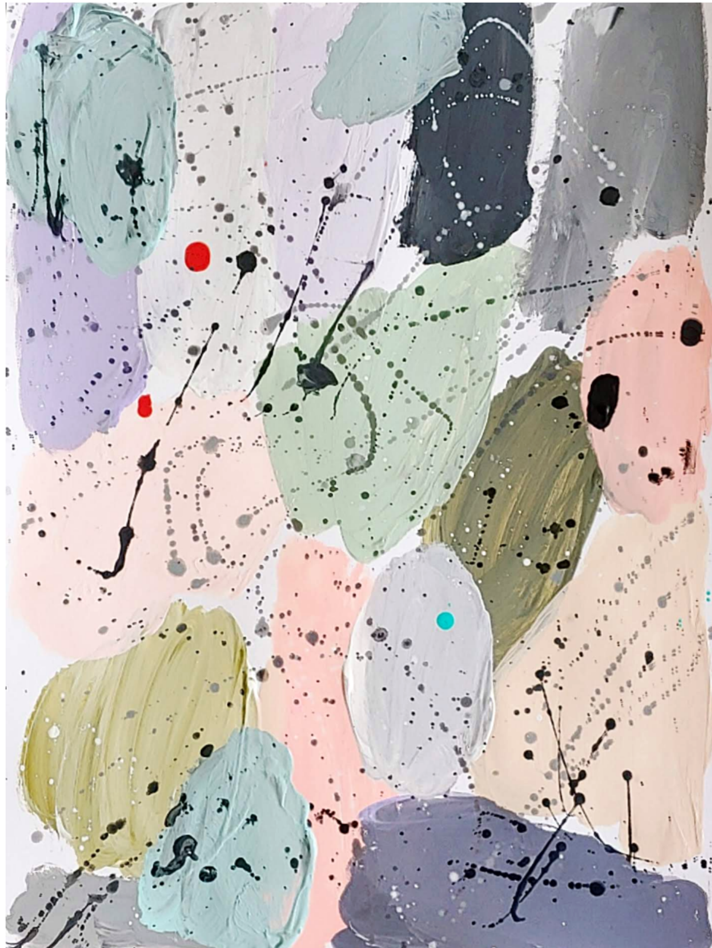
<Pallette_S #2> mixed media on paper, 29,7x42cm, 2020