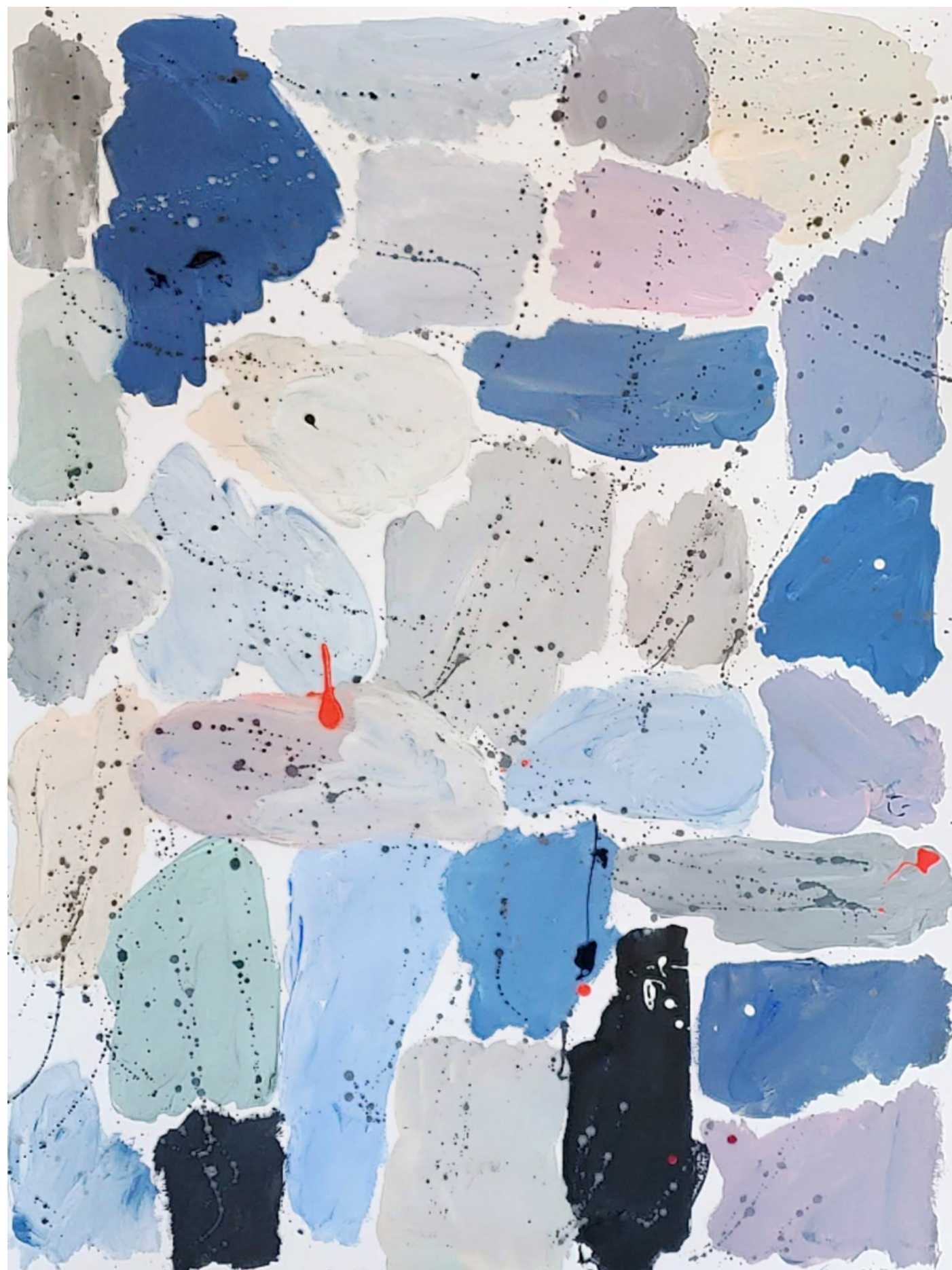
<Palette #5> mixed media on Paper, 50x70cm, 2020