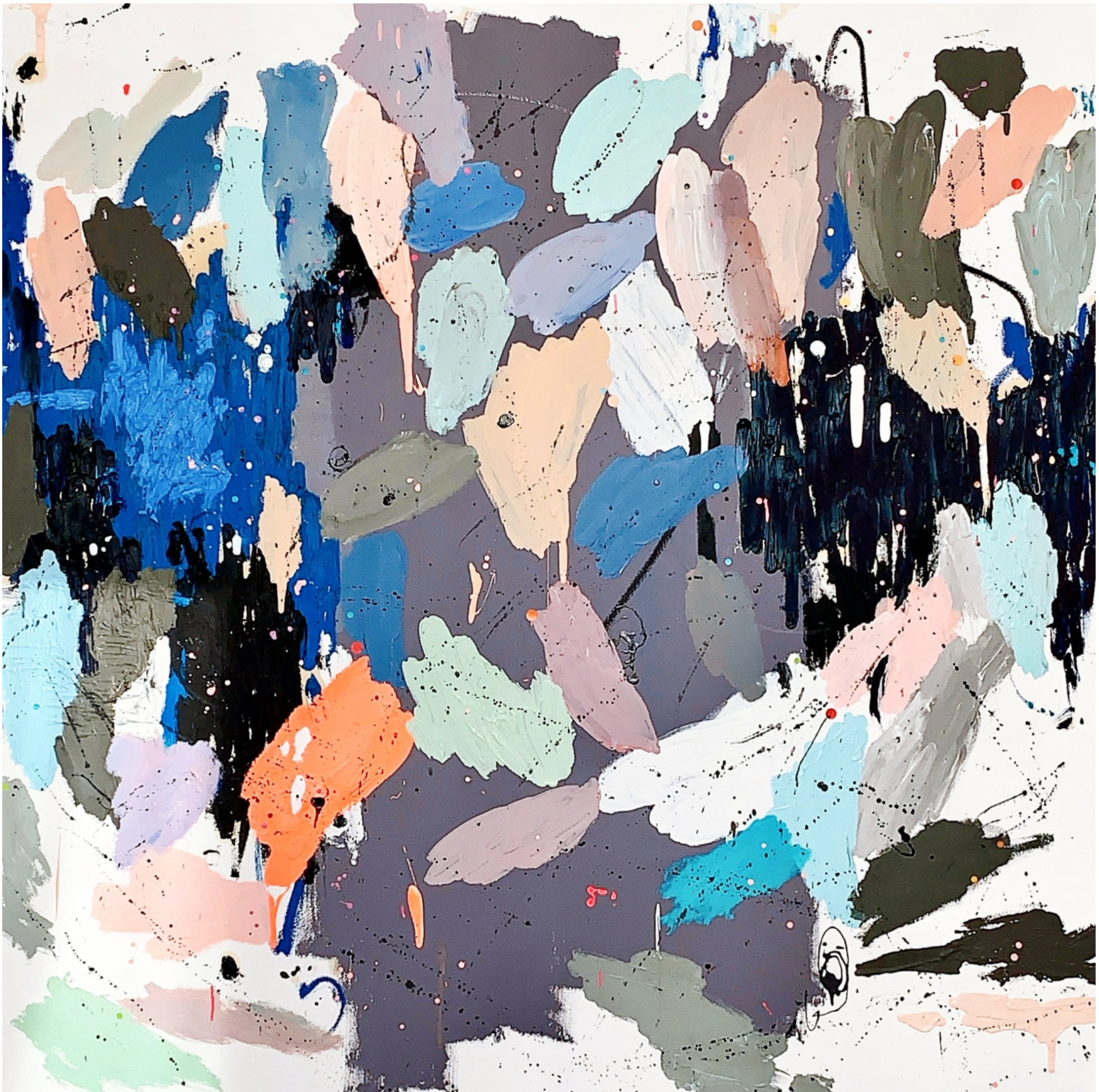
<Rework_1> mixed media on canvas,, 150x150cm, 2021