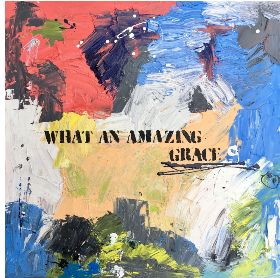
<what an amazing grace>, <grace upon grace>, <under greace>, mixed on wood, 60x60cm, 2019