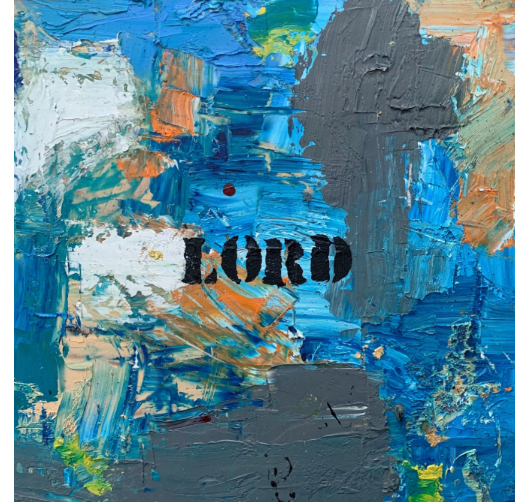
<undying love> <happiness> <Lord>, mixed media, 30x30cm, 2019