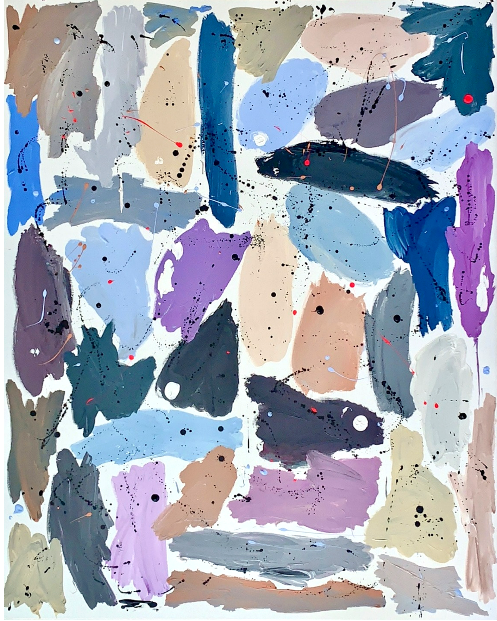
<Palette on paper> Acrylic on Canvas, 130x162cm, 2023