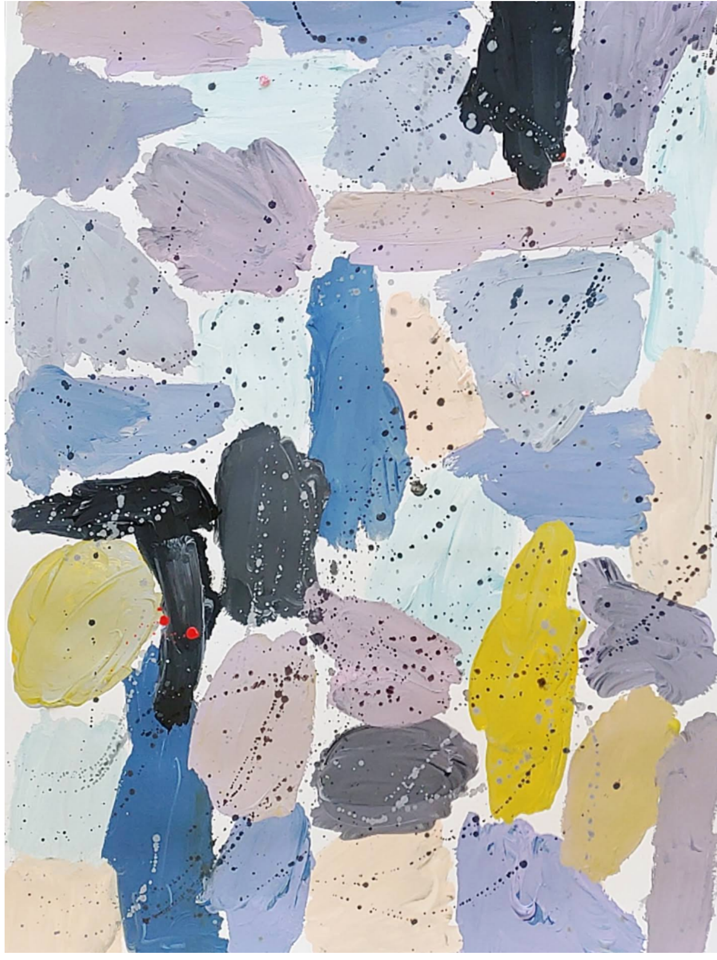
<Pallette #9, Pallette #20>, mixed media on Paper, 50x70cm, 2020