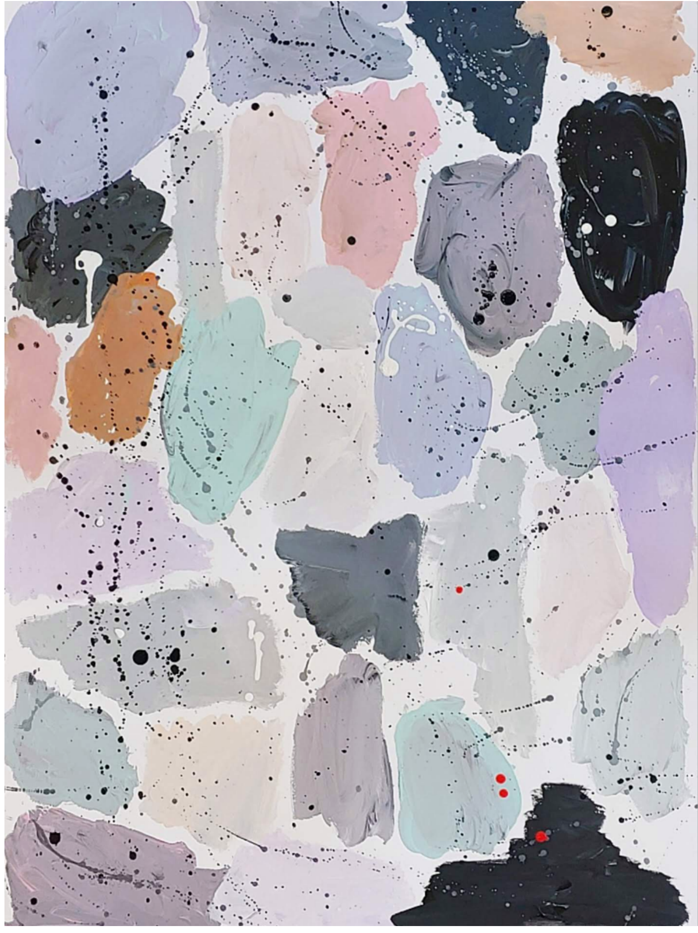
<Palette #9, Palette #20>, mixed media on Paper, 50x70cm, 2020